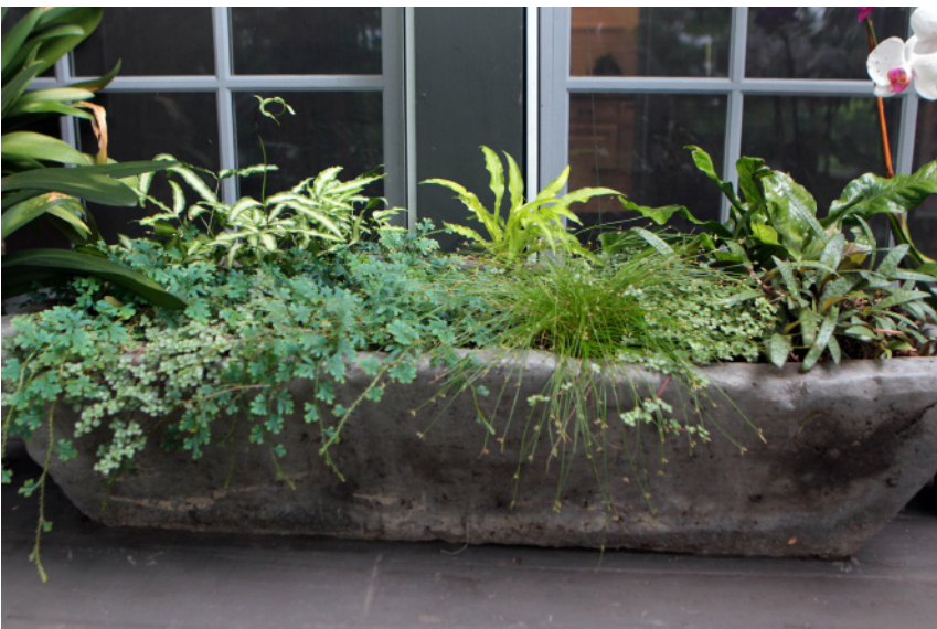
Anthropek Line containers (top and above) hold small plants.