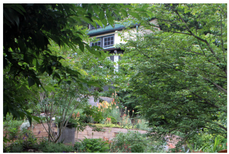
Another view of the backyard garden.