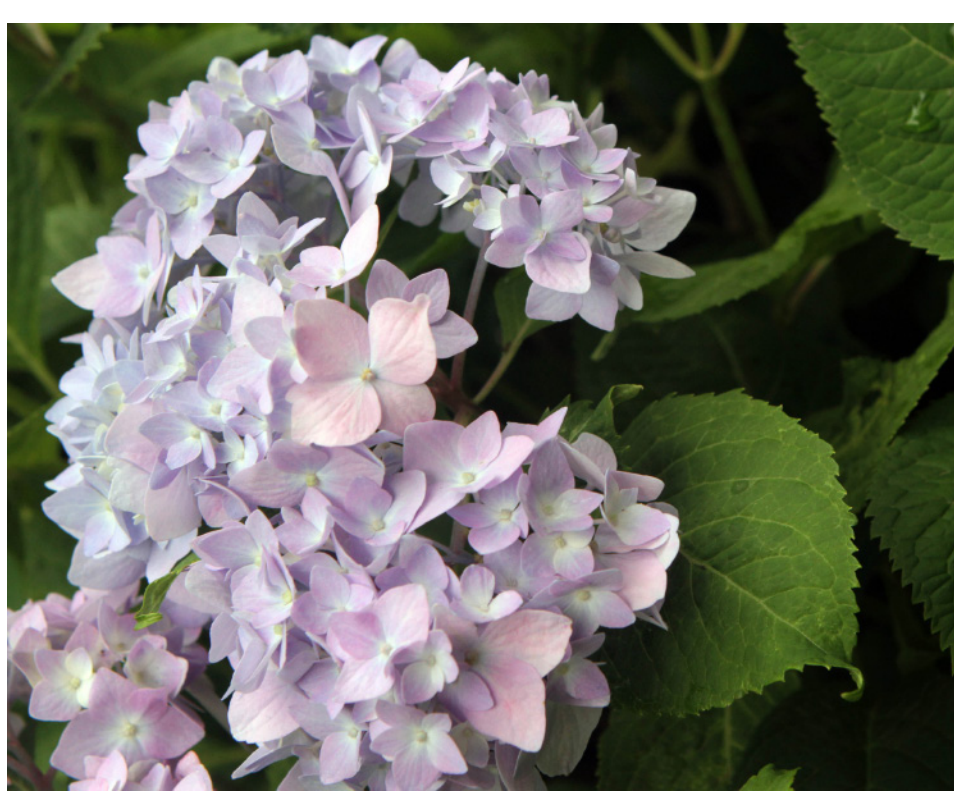
Purple hydrangea in the backyard garden.