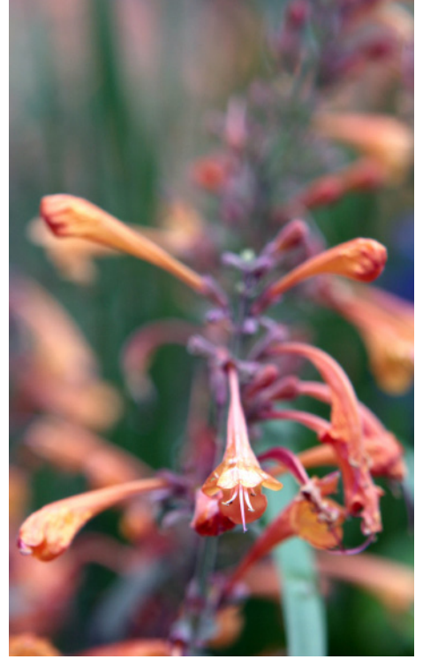
Agastache totally tangerine is one of many flowers in the backyard garden.