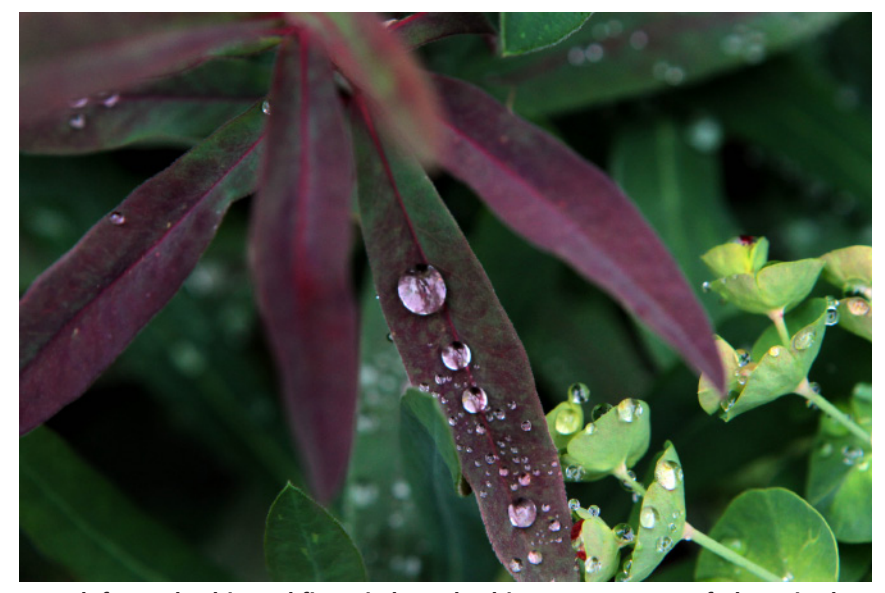
From left, euphorbia and fire witch euphorbia are two types of plants in the backyard garden.