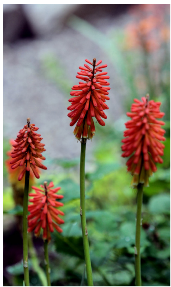
Red hot poker plant is one of many plants in garden designer, Robert Welsch's backyard garden.