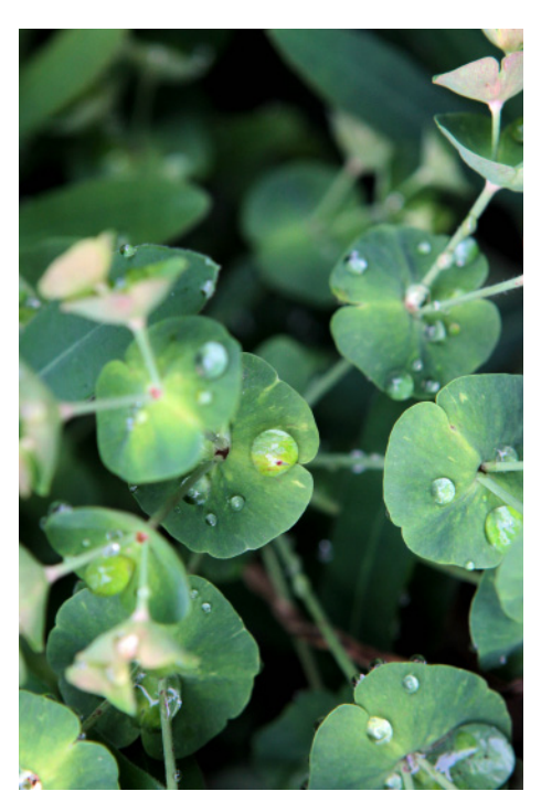
Dutchman pipe vine plant (left and center), euphorbia plants (right) and Oak leaf hydrangea (below) are some of the many plants in the backyard garden.